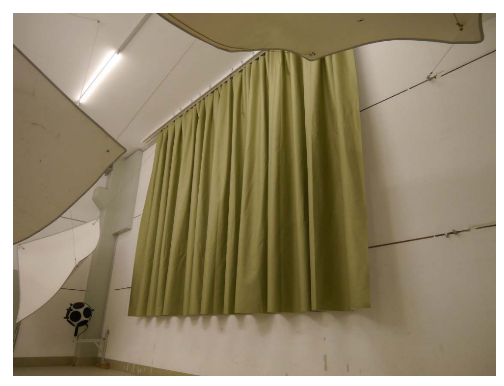
Figure B.2. Test object mounted in the reverberation room, diagonal view.